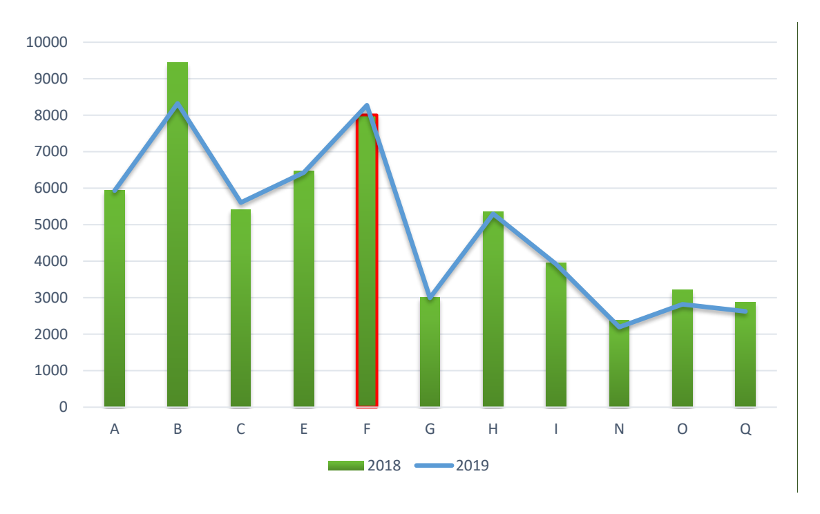
Fig. 1. Accident Incidence Rate in working days of salaried workers from the principal productive sectors of Spain, organized by CNAE codes, for the years 2018 and 2019. Where:

records of the Spanish Ministry of Work and Social Economy [Ministerio de Trabajo y Economía Social] (MITRAMISS, 2020) (Fig. 1).