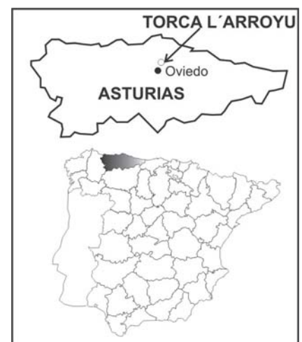
Fig. 1.- Geographical location of Torca l'Arroyu.

of the Tertiary of the Basin of Oviedo; then, the river gets into the Carboniferous limestones of the Naranco hill, more towards the W. The cave is located in the slope of the right side of the Nora river,