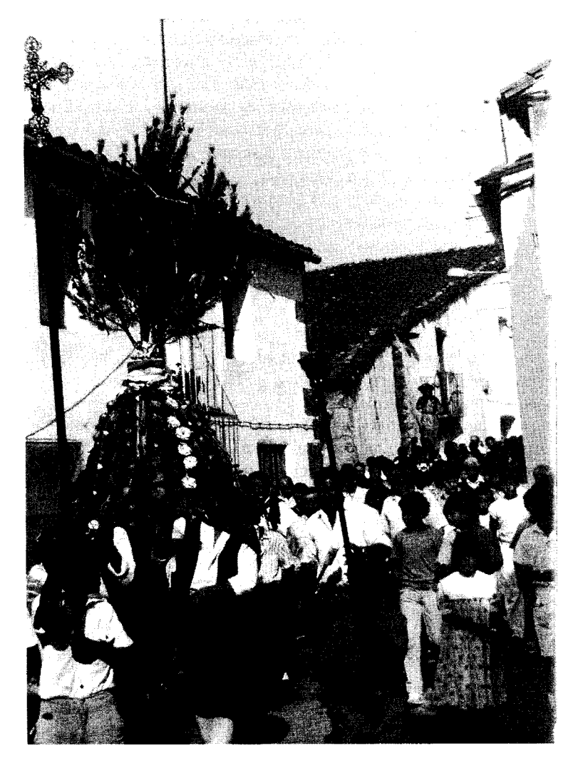
Plate 4 Patronal procession in Piornal. The ritual offering (ramo) is carried in front of the statue of the patron saint.

eat and drink. Verbena and baile denote a performance of small hired band which plays for several hours in the centre of the village while participants dance in a designated space. By contrast, the charanga moves through the streets with trumpet-and-drum music, occasionally followed by the public. Together with folk modalities of