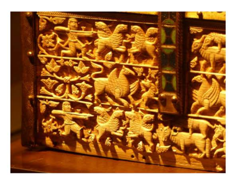
Figure 4. Archers, lions with juxtaposed bodies and lions attacking bulls on the front plaque of the casket from Santo Domingo de Silos, 1026, currently in the Museo de Burgos, Spain.

On the right-side plaque of the Silos casket, two affronted peacocks with intertwined necks can be observed (Figure 5). This is a recurring theme in the Andalusi carvings of the 'Amirid period, and we find it, for example, in the casket at the Victoria and Albert Museum in London from the early 11th century (inv. n^{\circ} 10, 1866). This motif also has its parallels in some Romanesque examples, such as in a corbel in the church of Santa Marta del Cerro in Segovia, from the early 13th century, where the same pattern is adopted, although with a more heavy-handed carving and a different arrangement of the birds' bodies, appearing vertically to conform to the shape of the corbel (Figure 6). The motif of a pair of birds intertwined by their necks appears in other Romanesque reliefs, such as on a capital form the church of San Miguel in San Esteban de Gormaz in Soria (Figure 7).