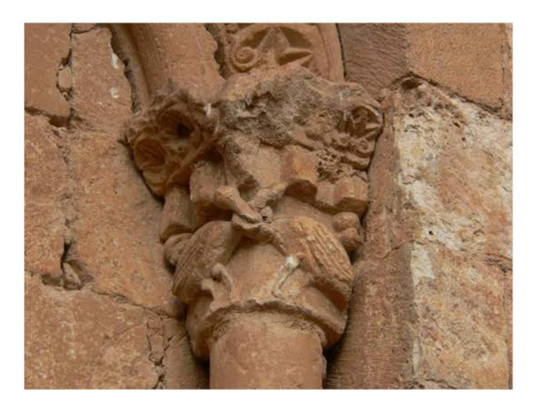
Figure 7. Birds with intertwined necks on a capital form the Romanesque church of San Miguel in San Esteban de Gormaz in Soria, c. 1081.

Flanking both sides of the peacocks on the Silos casket are lions biting the hinds of deer (Figure 5). These felines adopt a peculiar posture that is quite characteristic of Amirid and Taifa art, with their heads seen from above while their bodies appear in profile. This detail is incorporated in some early Romanesque examples, such as the capital of the San Salvador chapel in the Romanesque cathedral of Santiago de Compostela, as Walker already observed, built in the last quarter of the 11th century under the patronage of Alfonso VI ([30], p. 268). Other Romanesque reliefs include this peculiar posture, as can be seen in the