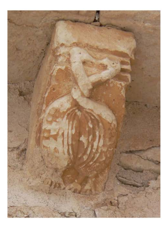
Figure 6. Corbel with birds with intertwined necks form the Romanesque church of Santa Marta del Cerro (Segovia), beginning of the 13th century. (Photo: Inés Monteira).