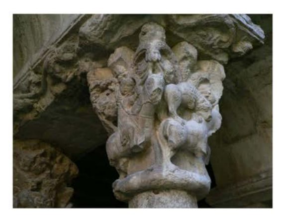
Figure 8. Lion attacking a bull and Almoravid archer on capital n° 4 in the cloister of the cathedral of Santa Maria, Gerona (northwest face).

lion attacking a quadruped in capital No. 4 of the cloister of the cathedral of Santa María de Girona (Figure 8).