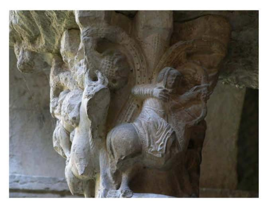
Figure 9. Almoravid archer with Negroid features and lion attacking a bull. Northeast face of capital n^{\circ} 4 of the cloister of the Girona's cathedral. (Photo: Inés Monteira).

Nevertheless, the outstanding motifs on the Silos casket are undoubtedly the archer and the figure of the lion attacking a bull, which appear four times on each of the main façades of the box (Figure 4). Although the conquering lion is a very frequent topic in Islamic art ([31], pp. 164–166), the peculiarity of this Andalusi piece lies in placing this motif next to the representation of an archer. The same combination of themes and figures can be found in capital No. 4 of the cloister of the cathedral of Girona (Figure 9) and in other examples of Catalan Romanesque [32]. The incorporation of the conquering lion in the capital of Girona is carried out, furthermore, with some formal features that seem to explicitly allude to Andalusi ivories, while the archers present clothing and ethnic features that identify them as Almoravid warriors<sup>10</sup> (Figures 8 and 9). All this leads to the conclusion that the sculptors of this capital borrowed these motifs from Islamic art seeking to paraphrase their original message, since they use them as an emblem of conquest over the territory, as I have been able to analyse in detail in a recent article ([32], pp. 491–497)<sup>11</sup>.