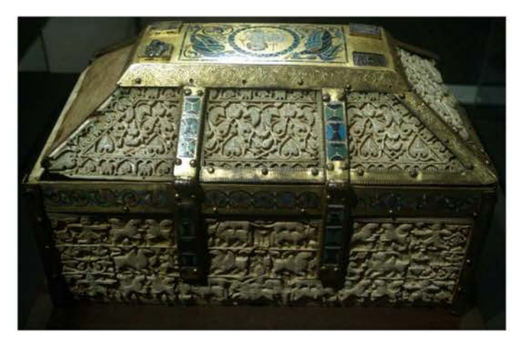
Figure 1. Ivory casket from Santo Domingo de Silos, made by Mohammad ibn Zayyan in 1026. Currently in the Museo de Burgos, Spain.

The Silos casket represents a key example in that we know in what context it was manufactured and that its second life in Christian hands began early (Figure 1). This ivory box measures 35 \times 19 \times 21 cm (width \times height \times depth). It was made in Cuenca in A.D. 1026 (417 H) by the artist Mohammad ibn Zayyan, as revealed by the Kufic inscription that runs through it. It was probably a commission from the Dhu'l-Nunid family that ruled the Taifa of Toledo at the beginning of the 11th century, although the part of the inscription that indicates the recipient is lost. It may have been mutilated through Christian intervention on the piece, as will be argued later on. According to several specialists, the hunting and fighting scenes between animals that decorate this casket were intended to symbolise the territorial power of the owner of the piece, while the vegetal motifs evoked paradise and the favour of Allah towards the ruler [19].