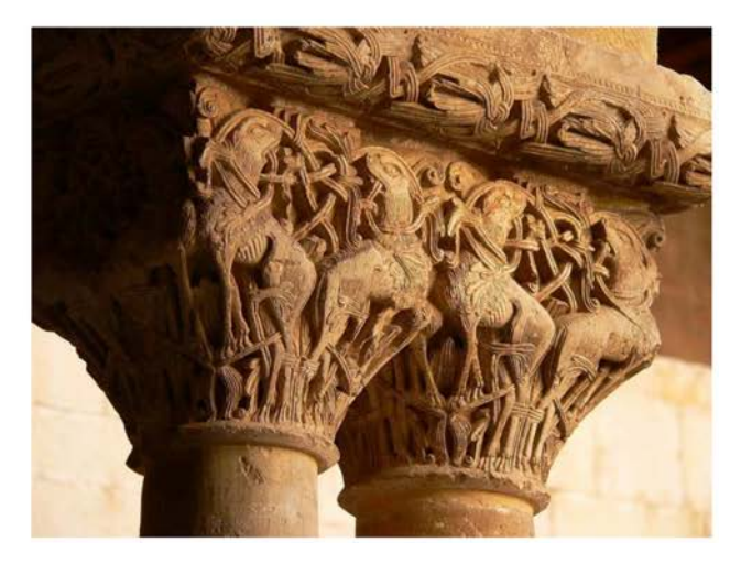
Figure 3. Lions turning their backs on each other. Capital n^{\circ} 6 from the East gallery of Santo Domingo de Silos cloister; first quarter of the 12th century.

The casket seems to have an initial bearing on the lower cloister of the Silos monastery, whose capitals are deeply drilled with a notable stylistic influence from Andalusi ivories, as various scholars have already noticed ([28], p. 21) and [29]. Capital No. 6 in the east gallery (dated towards the first quarter of the 12th century<sup>7</sup>) presents pairs of lions turning their backs and turning their heads backwards (Figure 3). The proportions of their heads, the disposition of their eyes and the incisions of their fur are very similar to those of the lions that form a cross with their bodies juxtaposed on the two broad faces of Ibn Zayyan's casket (Figure 4), as already observed by Pérez de Urbel ([28], pp. 22–23)<sup>8</sup>. These lions are, however, trapped by vegetal tendrils in the capital within a Christian symbolic discourse. Boto has also found similarities between the griffins and quadrupeds in this piece and an illustration from the Beatus of Fernando I and Sancha (c. 1047), where fantastic animals appear with very similar curved tails, arranged in the same way, in a horizontal register<sup>9</sup>.