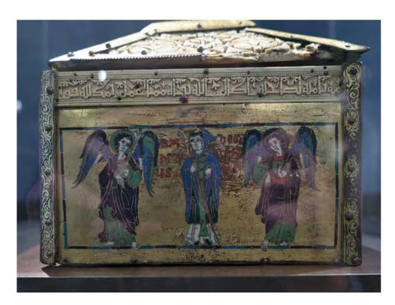
Figure 2. Saint Dominic with two angels. Enamel plaque on the left side of the casket from Santo Domingo de Silos, 1026 A.D. Currently in the Museo de Burgos, Spain

technique representing an Agnus Dei on the top of the lid (an image of Christ as the "Lamb of God") and Santo Domingo between two angels, on the left side of the box (Figure 2). The Silos enamel workshop was extremely active between approximately 1140 and the end of the 12th century. Although this workshop and its chronology are still a matter of debate, a recent analysis established the date of 1140–1150 for the enamels of the Silos Chest, which is the most accepted chronology [23] and ([24] pp. 1–31).