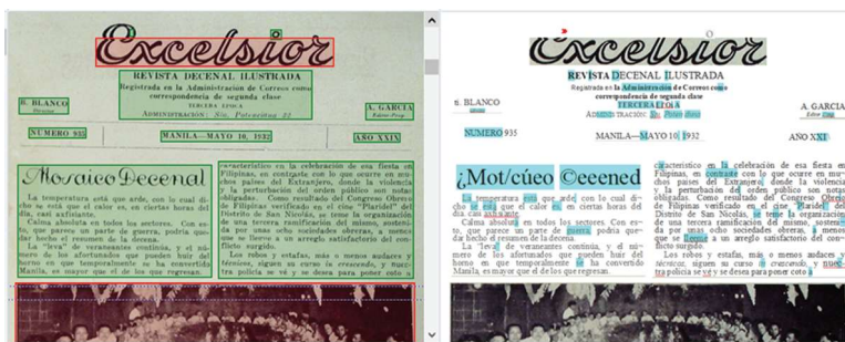
Figure 3. Recognition of text areas with ABBYY FineReader 14 with numerous errors, both in the text and in the recognition of areas of image and text in the 10 May 1912 issue of Excelsior magazine, scanned at the recommended resolution of 500pp

Although document scanners usually have an OCR software integrated, like ABBYY, which includes a layout recogniser and can produce ALTO/XML, the poor quality of some of the materials confirms the already well-known error rate of this OCR. ABBYY is moreover language bond. It means that their predictions are based on a number of languages pre-set. It thereby excludes -or poses a difficulty- to OCR the texts in minority languages present in our corpus, such as Cebuano or Ilokano. Even in texts in majority languages like Spanish, the mix of fonts and of text with image and artistic text produces area and OCR detection errors (see Figure 3).