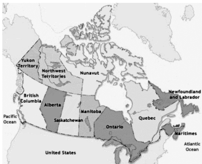
Figure 1. Map of Canada